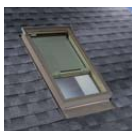
Solar battery lightblock shade